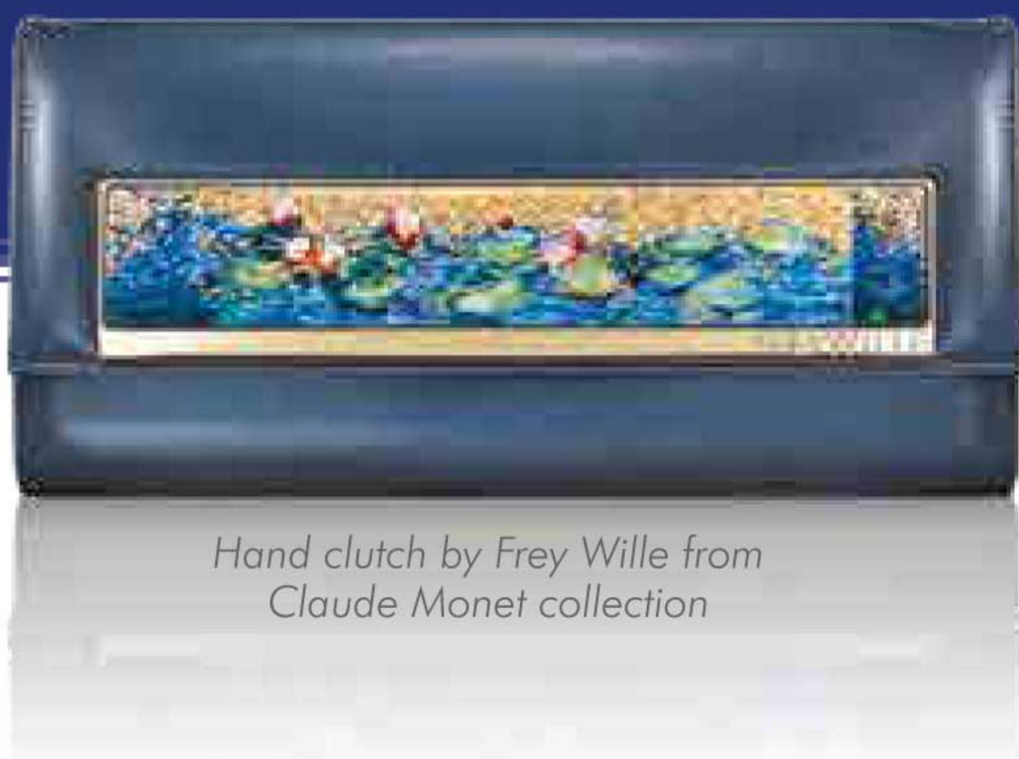
Hand clutch by Frey Wille from Claude Monet collection

FREY WILLE's team of passionate artists, designers, goldsmiths and enamel specialists have again done what no other could do by replicating the art of the French Impressionist 'Claude Monet'. They have created three ranges under this collection- Giverny, Honfleur and Orangerie which are truly to their inspiration and also in tune with the company's identity of uniqueness, brilliant colours and exclusive quality.