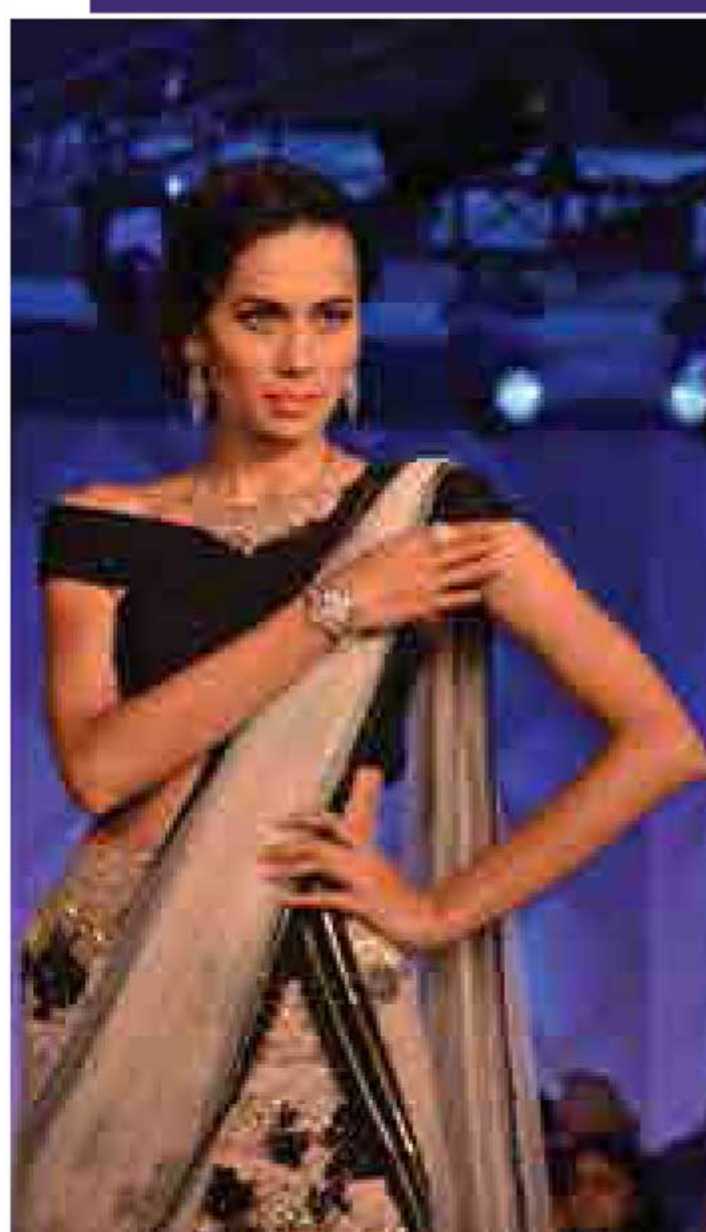
Model showcasing jewellery from Tanishq's Inara 2