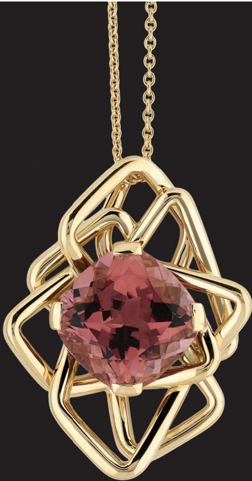
Tourmaline pendant in rose gold from the Disorient collection